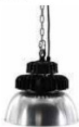
60° Aluminium Reflector