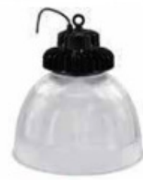
70° Clear PC Reflector