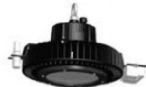
Daylight + Motion Sensor