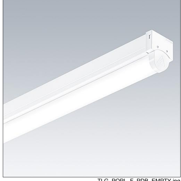
TLG POPL F PDB EMPTY.jpg